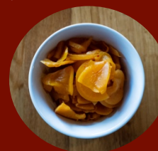
PICKLED RADISH $3.50