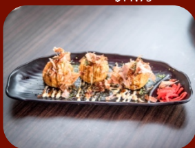
TAKOYAKI (3PC) $4.95