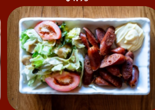
SPICY SAUSAGE $6.95