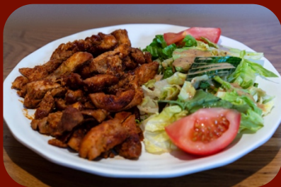
SPICY CHICKEN W/RICE $11.75