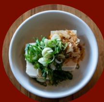
COLD TOFU $4.25