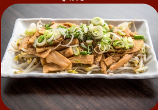
BAMBOO VEGETABLE SAUTE $7.25