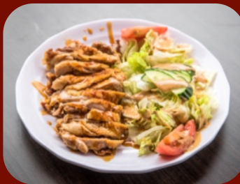
TERIYAKI CHICKEN W/RICE $11.50