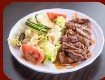
TERIYAKI BEEF W/RICE $12.25