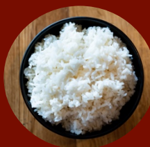
RICE $2.00 HALF RICE $1.50