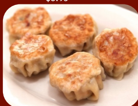
GYOZA DUMPLING $5.50