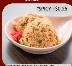
*SPICY +$0.25 FRIED RICE W/SOUP $10.25 HALF FRIED RICE $5.50