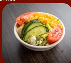
GREEN SALAD $3.25