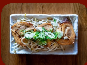
CHA-SHU PLATE $8.95