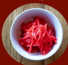
RED PICKLED GINGER $0.50